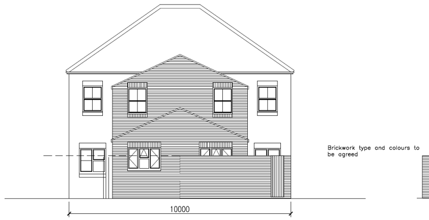
MIDDLETON WALK North elevation